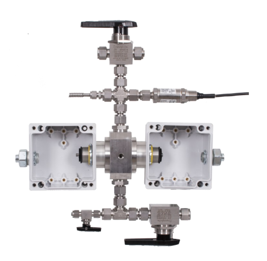
VeraSight Flowcell Assembly