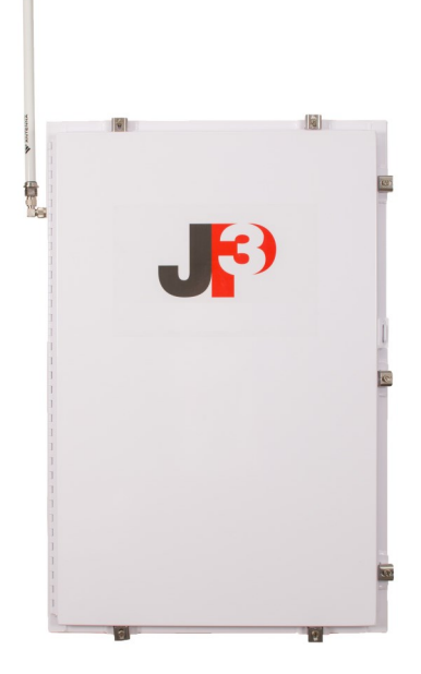
Verax CTX NIR Analyzer